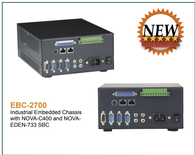
EBC-2700 Industrial Embedded Chassis with NOVA-C400 and NOVA-EDEN-733 SBC