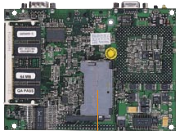
Compact Flash type II socket