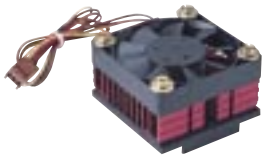
CF-506 PGA Type Socket 370 Cooler