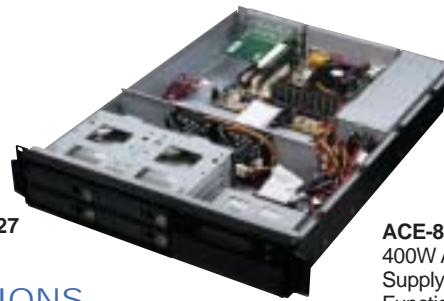
ACE-840APU2 400W ATX Power Supply with PFC Function