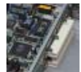
PCI-2SD2 Backplane Provides 2 Full Length PCI Add-On Cards in 1U Chassis