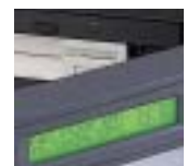
Best User Interface Designed by Front Panel 2 x 20 Characters LCD Module (A78)