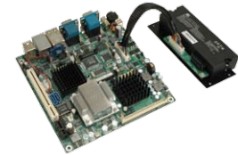
IEI motherboard with AUPS sub-system kits