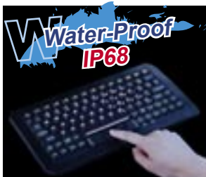
86 Key Water-Proof Keyboard with Pointing Device

Water-Proof Industrial Keyboard with Pointing Device