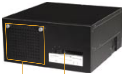
Cooling fan with removable filter