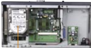
One 2.5" HDD drive bay