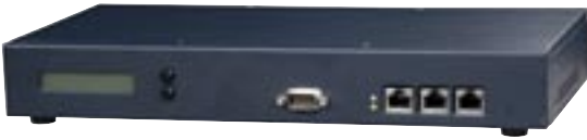
FWAP-2680L Desktop Solution